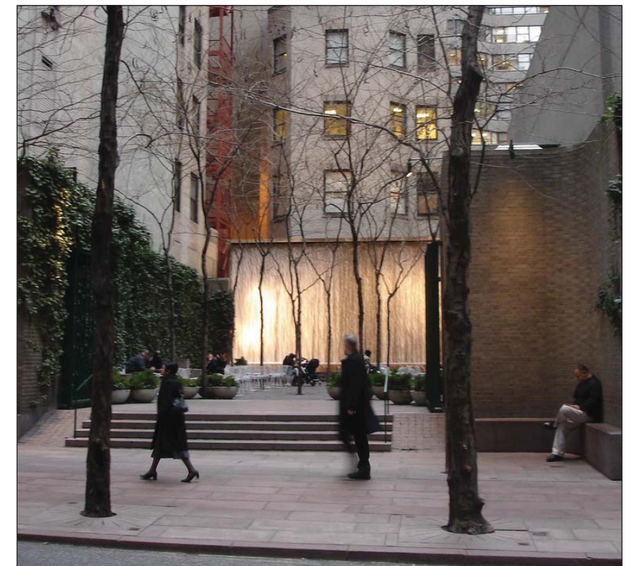
A small public space can be a great place. A waterfall in Paley Park, New York creates a large focal point and helps to hush the din of the city, while trees provide shade in the summer.