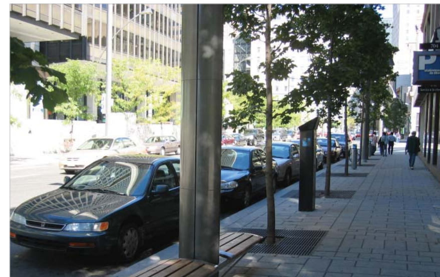
A "park street" in Montreal, Canada illustrating improved streetscaping, planting and pedestrian amenities.