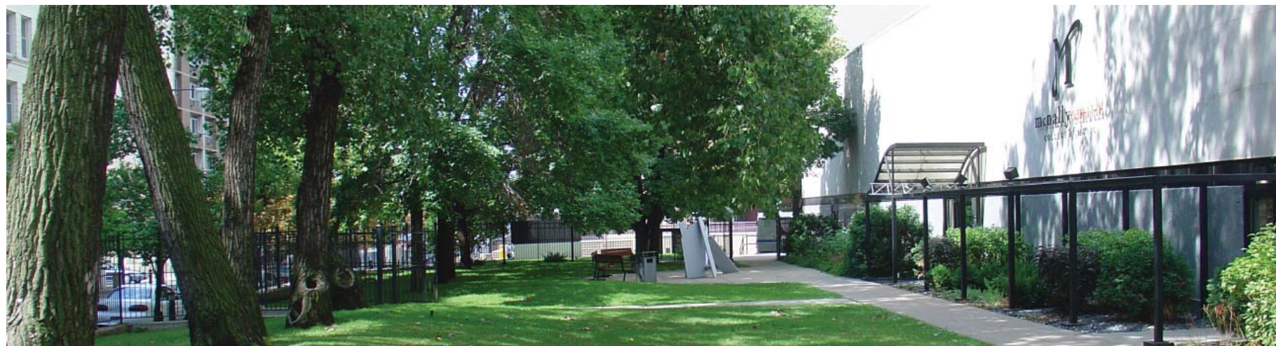
A small parkette in front of the McNally Smith College of Music provides a quiet escape from the city, an escape that could be enjoyed by more people if greater access were provided.

Existing parks and open spaces to be enhanced include the following: