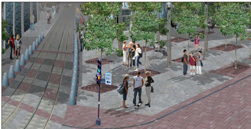
A rendering of how the LRT zone might look at the corner of Fifth and Cedar where the LRT passes diagonally through the block. Decorative paving and pedestrian bollards alert pedestrian crossing the LRT tracks. At this intersection, strips of concrete have been used along the streets to calm traffic and signal the pedestrian nature of the area.