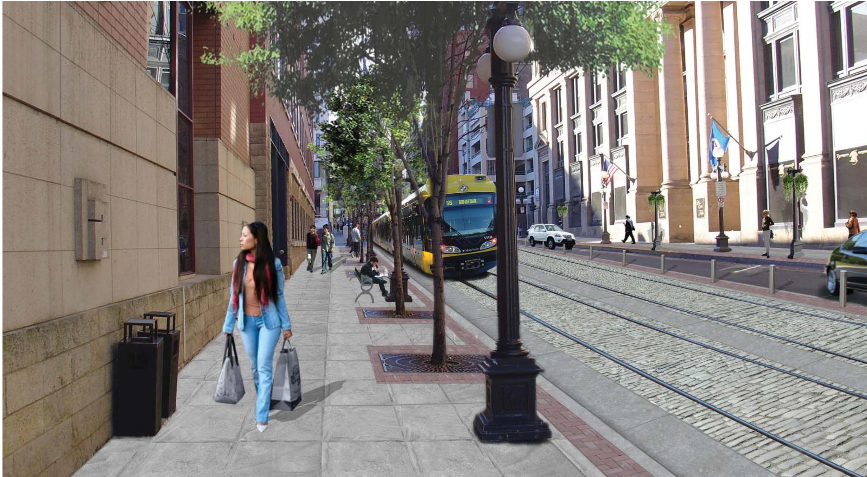
A rendering of what the LRT Zone along Fourth Street might look like, illustrating the enhanced streetscaping and planting. A strip of red brickwork helps to delineate the alignment of the LRT for pedestrians, while, along the street, bollards keep vehicles off the tracks. Across the street, where the narrow sidewalk widths make the planting of street trees difficult, hanging baskets help to green the street.