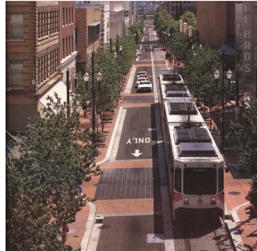
A pedestrian-friendly LRT Zone in Portland, Oregon illustrating enhanced streetscaping and planting. At this intersection, decorative paving helps to identify pedestrian crossings and delineate the boundaries of the LRT.