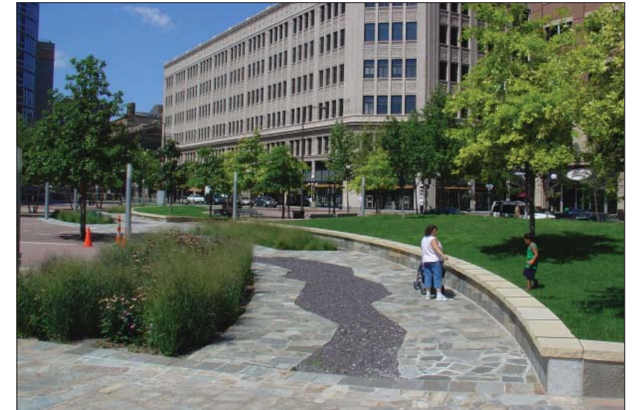
Landmark Plaza demonstrates how landscaping and public art can create a unique place out of what would otherwise be a leftover fragment of lawn.